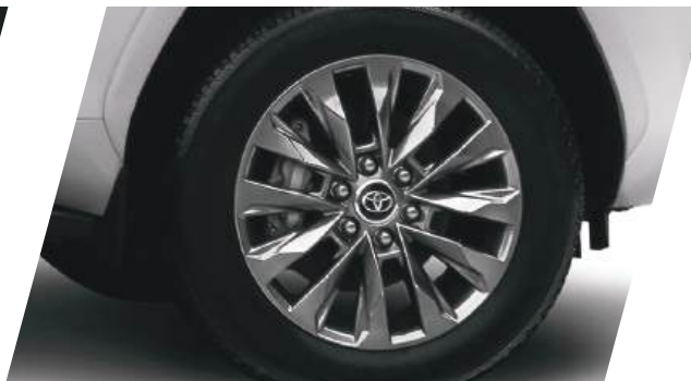
20-inch Premium Wheels