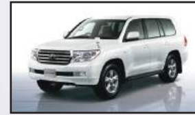
2007 Land Cruiser "200" series