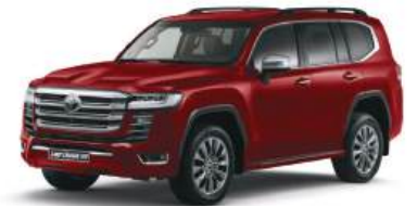
3Q3/DK Red MM