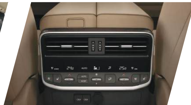
Rear Air Conditioning