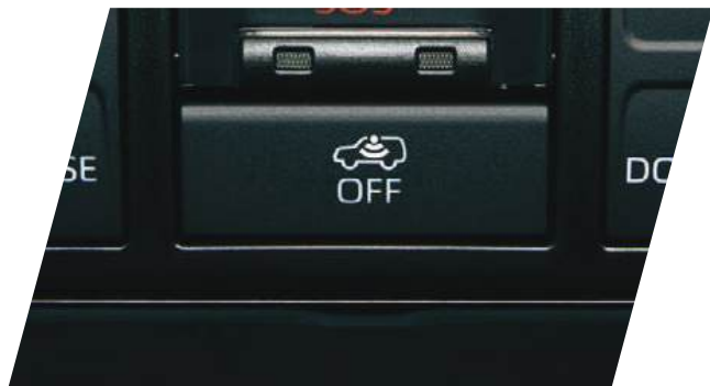
NanoE™ X Cabin Air Purification