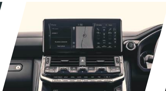
12.3 inch Multimedia Display