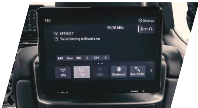
Rear Entertainment System