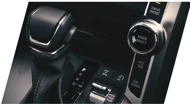
10-speed Automatic Transmission