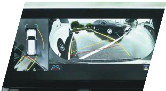
Multi Terrain Monitor with Panoramic View