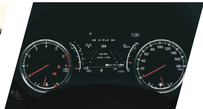
Intrusion & Inclination Sensor