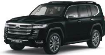
218/Attitude Black MC