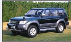
1996 Land Cruiser "90" Prado series