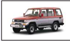
1990 Land Cruiser "70" Prado series