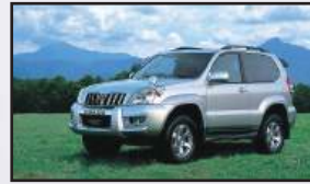
2002 Land Cruiser "120" Prado series