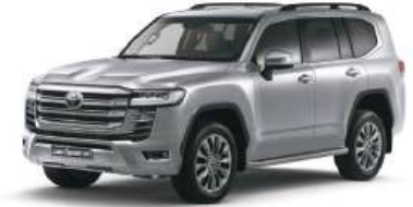
090/Precious White Pearl