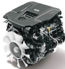
3.3L V6 Twin-Turbo Diesel Engine *3.45L V6 Twin-Turbo Gasoline Engine