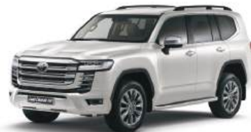
070/White Pearl CS