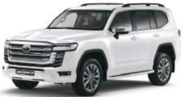
040/Super White 2