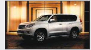
2002 Land Cruiser "120" Prado series