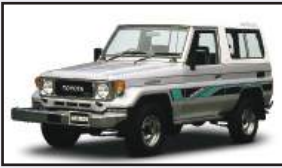
1984 Land Cruiser "70" series

For more than 70 years, the Land Cruiser has gone where others turned back - across deserts, mountains, and generations. The Land Cruiser 300 carries that legacy forward with uncompromised strength, advanced engineering.