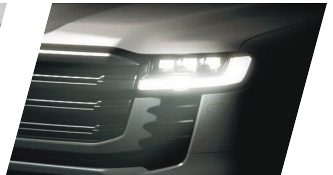
Adaptive LED Headlights