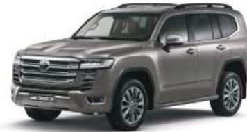
4V8/Avant-Garde Bronze ME