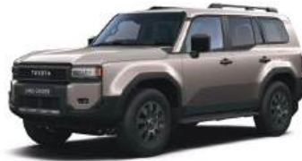
4V8/Avant-Garde Bronze ME