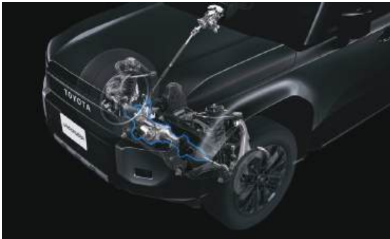
Electric Power Steering