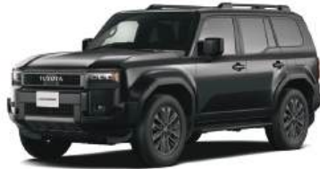
218/Attitude Black MC