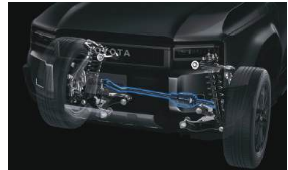
SDM (Stabilizer with Disconnection Mechanism)