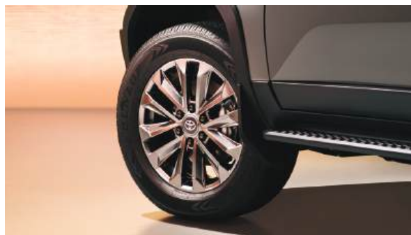
20-inch Alloy Wheels (Luxury) *18-inch Alloy Wheels (All-Rounder)