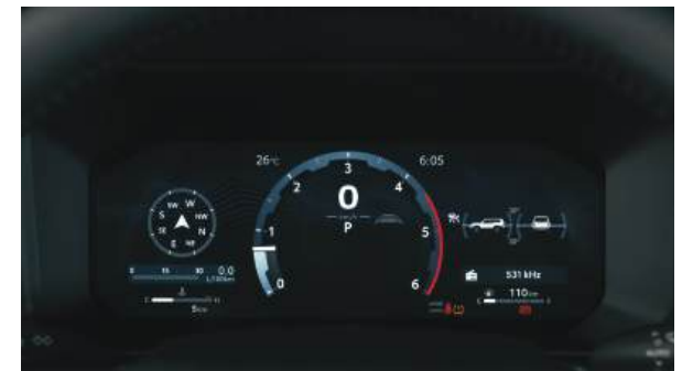
New Digital Display