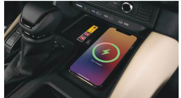
Fast Wireless Charger