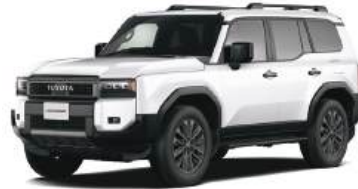
090/Precious White Pearl