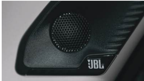
JBL Branded Sound System