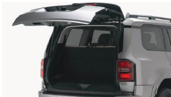
Convenient Cargo Access