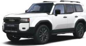
070/White Pearl CS