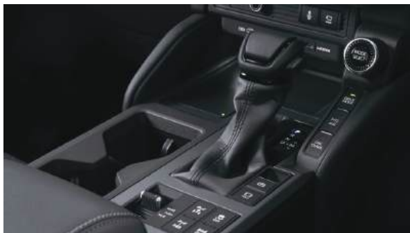
8 speed Auto Transmission

■ Comfort is extended throughout the Land Cruiser with a fully leather-upholstered cabin