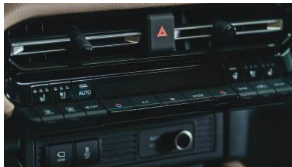
Climate Control Panel