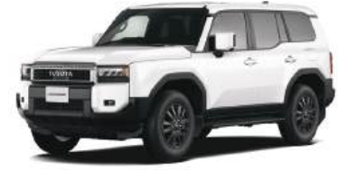
040/Super White 2