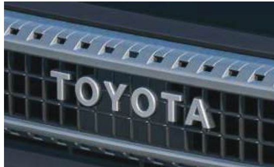
Heritage Toyota Badging